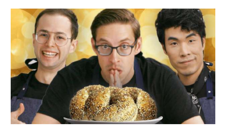
Follow the link: <a href="https://www.youtube.com/watch?v=V4Uuxg6jmbo">https://www.youtube.com/watch?v=V4Uuxg6jmbo</a>

They still did better than I could! The Try Guys are an American quartet who like to try anything! They post videos on YouTube about their adventures and various challenges that they try together. In this episode, the boys attempt to make bread without a recipe! I'm sure many of you have been trying new things at home so might have had a similar experience yourself. Watch the first minute of the video, pause and guess who you think will make the best bread. Watch more Try Guys videos to improve your listening for American accents and informal vocabulary.