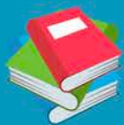
Grammar & Vocabulary

Our Skills classes are designed to provide General English students with additional skills in key areas of learning. For one or two hours per day, students will focus on a particular area of study to master its techniques and strategies.