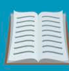
Reading & Writing